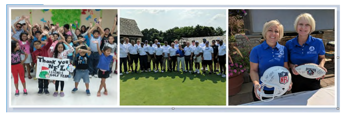
FAMILY: We continue to value "Family" as our children grow up in our home. We look forward to continuing to provide our children with opportunities they never dreamed were possible. We have been blessed in so many ways because of the tireless work of our dedicated staff of former orphans, and the community of supporters that we deeply appreciate. WE ARE TRULY CHANGING LIVES TOGETHER!

SPECIAL EVENTS: Each year we host an NFL Legends Golf Fundraiser to support our children which includes 24 NFL players with 12 of the Hall of Famers. This year's event will be held on Monday August 13, 2019 at the Biltmore Country Club in North Barrington, Illinois. Please email me at <u>shinskjo@gvsu.edu</u> if you are interested. Individuals and corporate sponsors are welcome.