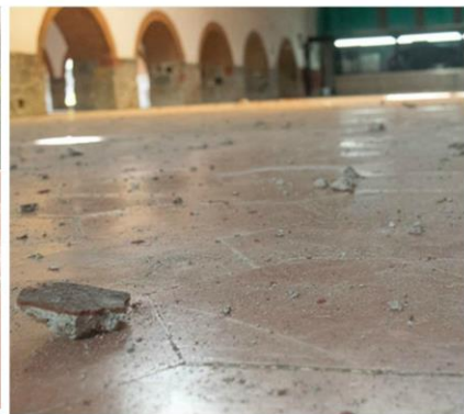
MIACATLÁN: COMEDOR / DINNING HALL

EARTHQUAKE DAMAGE: Our children start their lives in Matamoros Mexico at the Shinsky Home. Once they reach the 10 th grade, they move to NPH Mexico in Cuernavaca and Miacatlan Mexico. Unfortunately, Cuernavaca and Miacatlan Mexico suffered over 5 million dollars' worth of damage due to the earthquake. Our children are very resilient, are doubled-up in available dorms, and are eating under a large tent because our cafeteria was seriously damaged. Our staff are our heroes who continue to work day and night for our children. We will recover from this challenge; however, it is going to take many years. Most important, we are blessed that no one got hurt. With your love and prayers, we will recover and thrive!