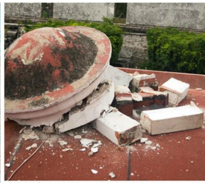
MIACATLÁN: ESTRUCTURA SOBRE EL TECHO DEL COMEDOR / STRUCTURE ON THE ROOF OF THE DINING HALL