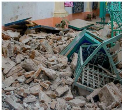
ROS DENTRO DEL MUSEO / RUBBLE INSIDE THE

FAMILY: After 8 years, we now have children from ages 5-18. Our high school graduates do 2 years of service giving back at our home by providing a good example for what our children should strive to become.